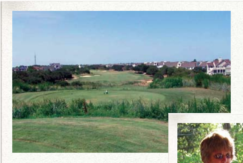
The Currituck Club, North Carolina