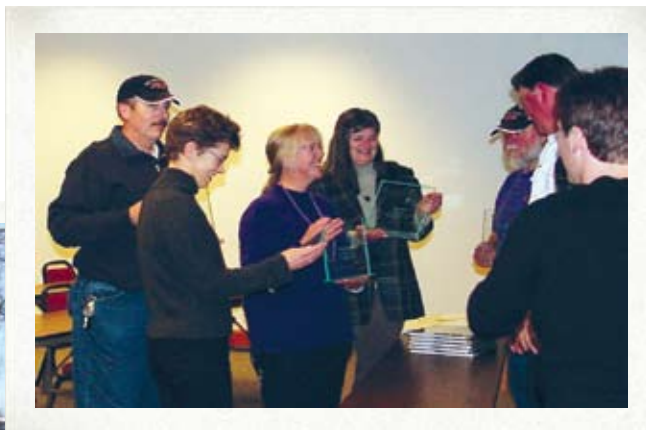
San Juan Island, Washington