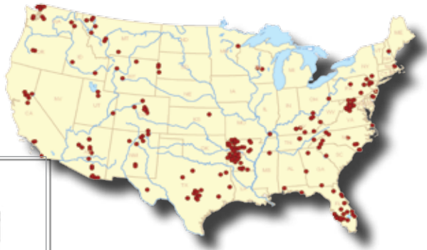
Each red dot on the above map marks an active Firewise Communities/USA site, effective December 31, 2007.