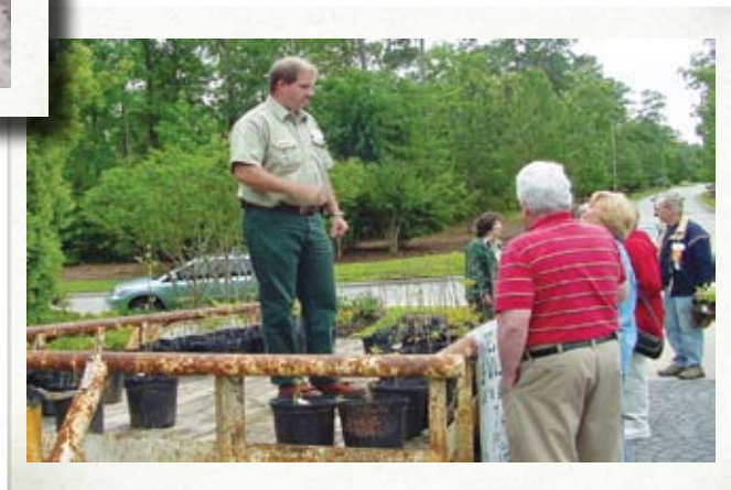
Windsor Heights, Texas