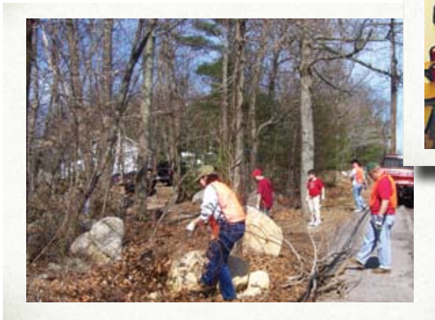
Turkey Hill, Massachusetts